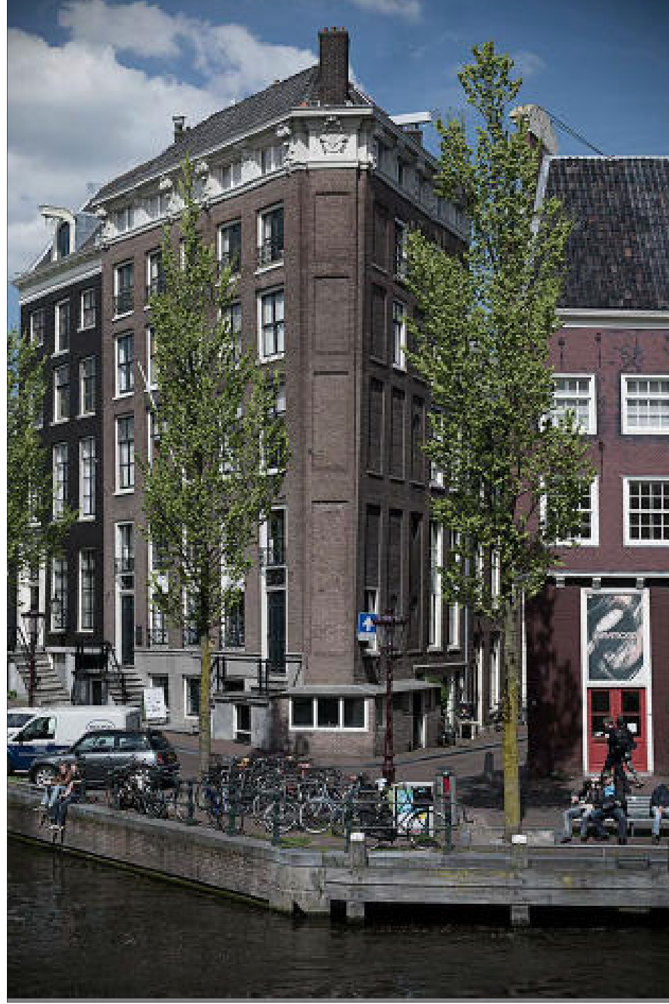
Castrum Peregrini was a WWII safehouse